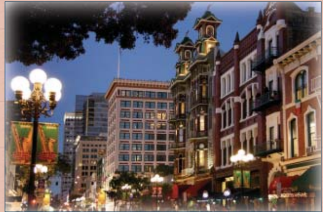
The U.S. Grant Hotel sits alongside the vibrant Gaslamp Quarter.

Surrounding THE US GRANT, the historic, vivacious Gaslamp quarter entices with a dazzling array of dining, shopping, nightlife, and entertainment venues for all ages, including the renowned Westfield Horton Plaza Shopping and Entertainment complex, which features Nordstrom, Macy's, Louis Vuitton, and Coach along with 130 specialty stores. Nearby, the San Diego Convention Center, Seaport Village, Embarcadero, Little Italy, Santa Fe Train Depot, and San Diego Cruise Ship Terminal offer endless adventure. Even the Padres' Petco Ballpark is within walking distance.