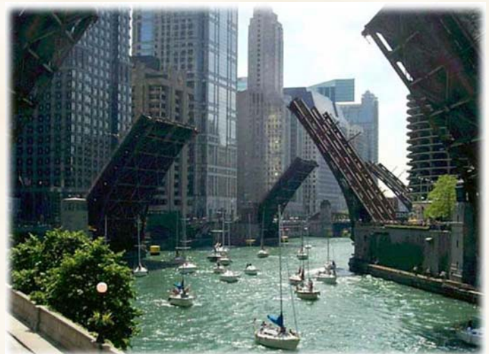
The bridges of Chicago make way for the sailboats ... a site to see.