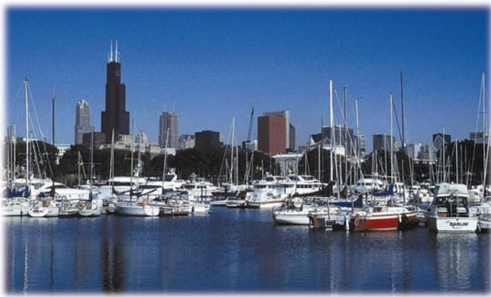
Lake Front. Beaches, boats, and blue skies await all of those visiting the city, providing over 29 miles of Lake Michigan shoreline to use as your playground.

7:15-8:15am Sciton User's Group Breakfast Meeting 8:15-11:00am Glenn Morley, Consultant Your Vote Counts! Jack Anderson Lectureship (part of AAFPRS Plenary Session) 11:30-11:45am 12:15-1:15pm Lunch with Exhibitors 1:15-2:45pm Panel Discussion with Physicians 2:45-3:45pm "Our Practice is Different" Breakout Sessions - Hospital/University Based Practices, Private Practices 3:45-4:15pm THE BIG EVENT - Don't Miss This!