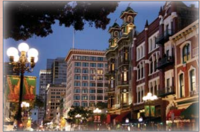
The U.S. Grant Hotel sits alongside the vibrant Gaslamp Quarter.

Surrounding THE US GRANT, the historic, vivacious Gaslamp quarter entices with a dazzling array of dining, shopping, nightlife, and entertainment venues for all ages, including the renowned Westfield Horton Plaza Shopping and Entertainment complex, which features Nordstrom, Macy's, Louis Vuitton, and Coach along with 130 specialty stores. Nearby, the San Diego Convention Center, Seaport Village, Embarcadero, Little Italy, Santa Fe Train Depot, and San Diego Cruise Ship Terminal offer endless adventure. Even the Padres' Petco Ballpark is within walking distance.